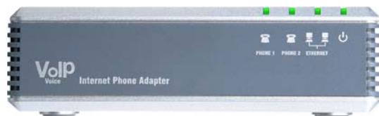
Figure 2-2: Front Panel

The Phone Adapter's LEDs are located on the front panel.