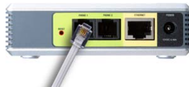
Figure 3-4: Connect the Telephone Cable