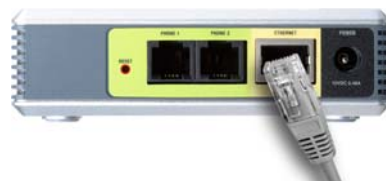
Figure 3-2: Connect the Ethernet Network Cable

Proceed to the next section, "Placement Options," if you want to attach the Phone Adapter's base.