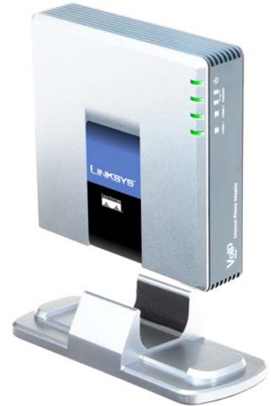
Figure 3-5: Attach the Phone Adapter's Stand (Optional)

Congratulations! The installation of the Phone Adapter is complete.