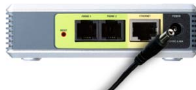
Figure 3-3: Connect the Power Cable