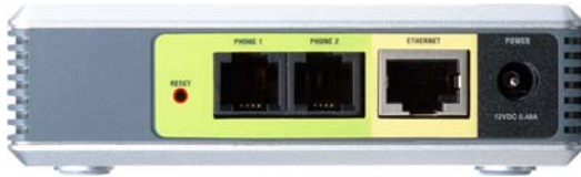
Figure 2-1: Back Panel

The Phone Adapter's ports are located on the back panel.